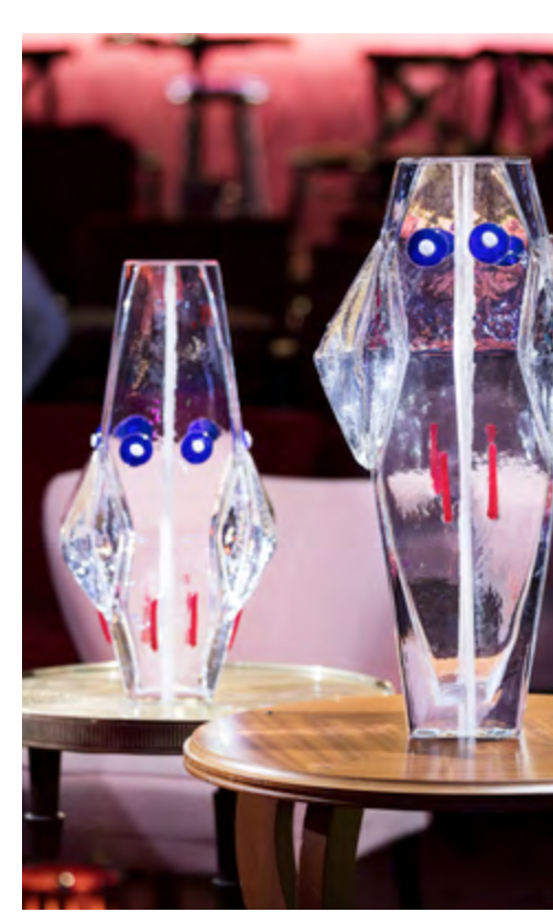
Monster Collection / Rombo by Alessando Mendini