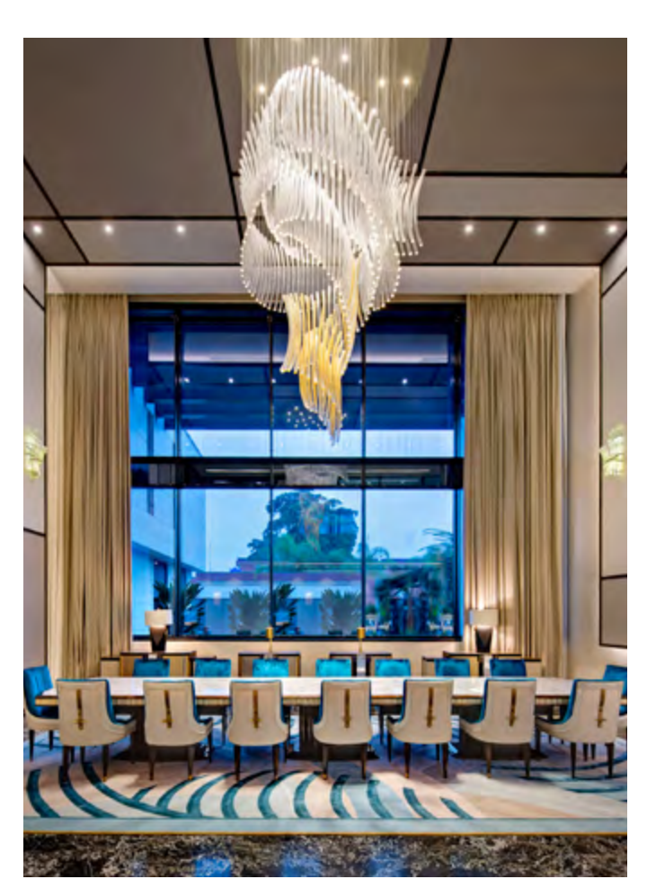
Bellagio / Shanghai

Alain Ducasse Restaurant at Morpheus / Macau