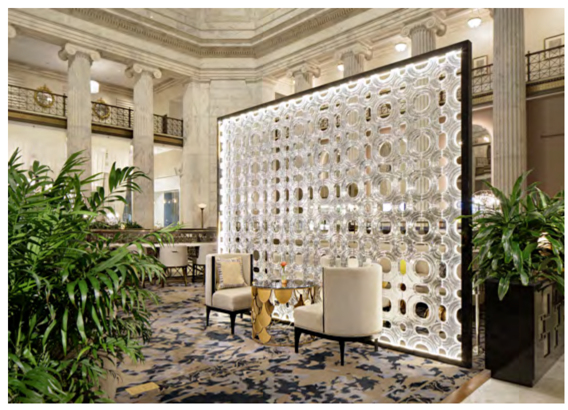
Lasvit Crystal Wall / The Ritz-Carlton Philadelphia